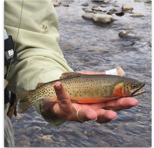
Rio Grande Cutthroat