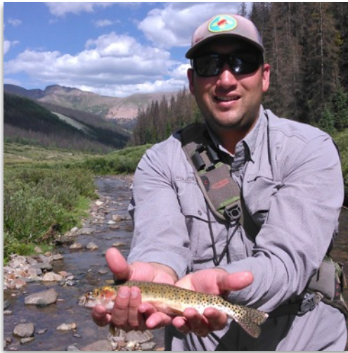
Mickey and Rio Grande Cutthroat

Dry Creek resides at the River Center mall; NE corner of River and Craycroft and is open Tuesdays through Saturdays from 10 am to 7 pm Tuesday to Friday and 9:30 am to 6 pm on Saturday. Address: 5655 East River Road, Suite 131, Tucson, AZ 85750 and phone (520) 326-7847. East side of the River Center between a beauty shop and Japanese restaurant. Eric is a long-time supporter of OPTU and we all need to be sure to support him. So get over to DCO and buy some of those essential things you know you need. The Editor