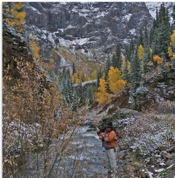
Marsett on the Lower Cunningham