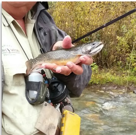
Brookie on Cunningham Creek