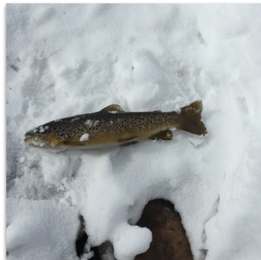
Flash Frozen (not really)