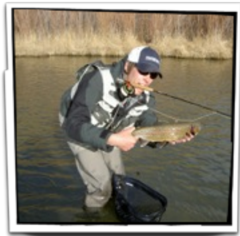
San Juan and Lees Ferry

Dates will be Sunday April 13 to Friday April 18, 2015. If you are interested the cost should be about $450 for all food, lodging, transportation, and fun. Contact the editor at jemurphy51@me.com to sign up. Trip is limited to 9 people and is half full at present. Money won't be due till about December.