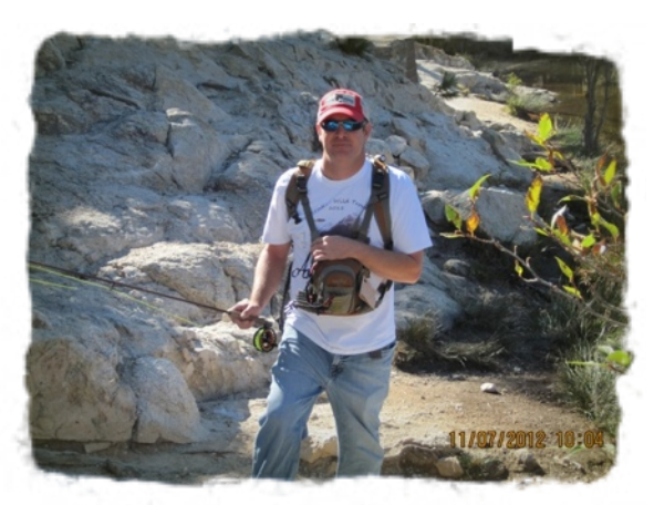
Rose Canyon Expedition