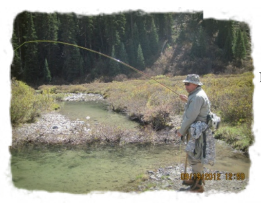
Project Healing Waters Album