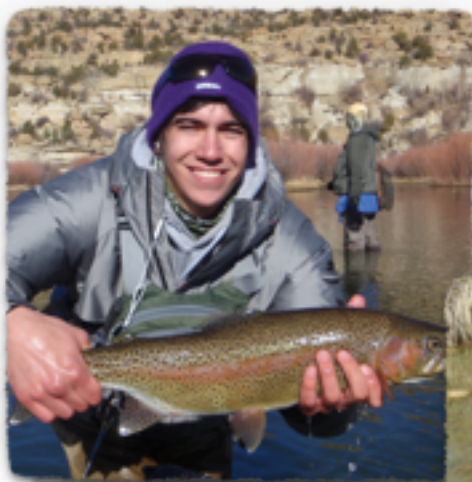
San Juan Trips Past

Two proposed regulation changes have been put before the Arizona Game and Fish Commission that have an impact on the trout populations of the Pinalenos and local fishing opportunities. It is being proposed that Frey Creek be opened to fishing with the following limitations: Season from 1 Oct to 31 March annually, catch and release, single hook, barbless, artificial only. The other proposed change is for Grant Creek. It is as follows: Catch and release, single hook, barbless, artificial only. The final decision on these changes will be made at the meeting on 5, 6 September and if approved they will probably be implemented in January 2015. Robin Marsett