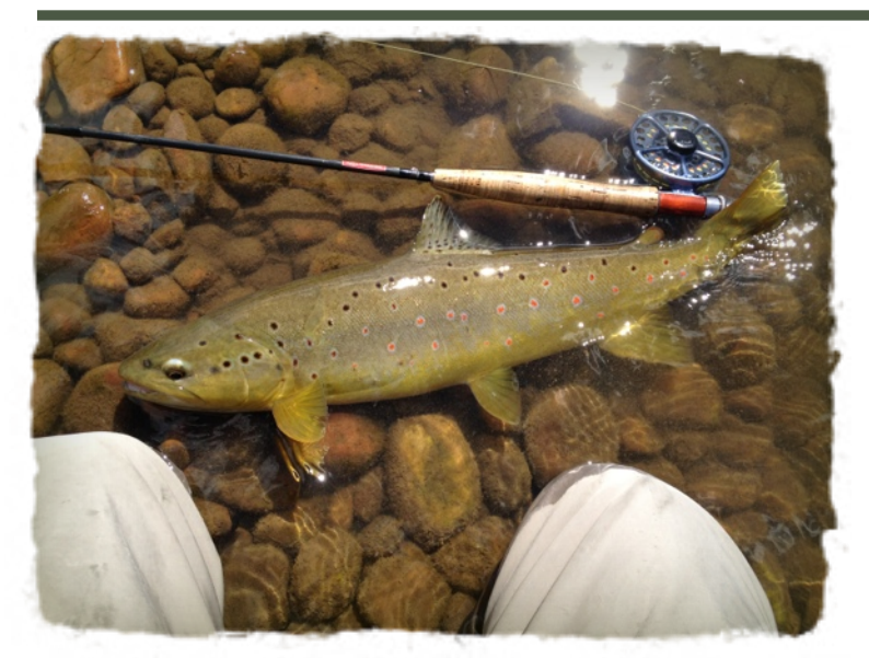
The one that (fortunately) didn't get away

small pool with me being as gentle as possible. It jumped two more times, which is always a good time for a fish to break off, but I managed to hold tight. After a 3 to 4 minute fight (at least it seemed that long), the fish was brought to shore for a couple of quick pictures and a release.