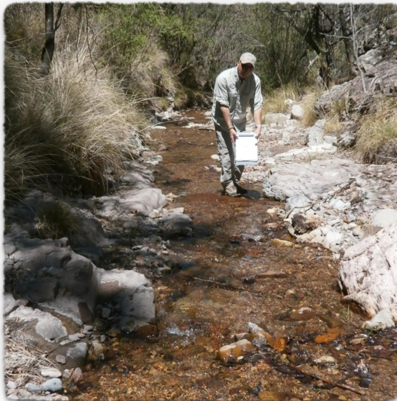
Cave Creek Dam