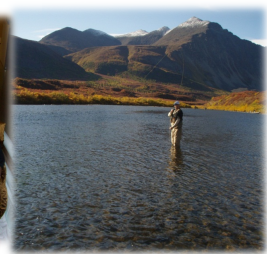
Much needed chance to decompress