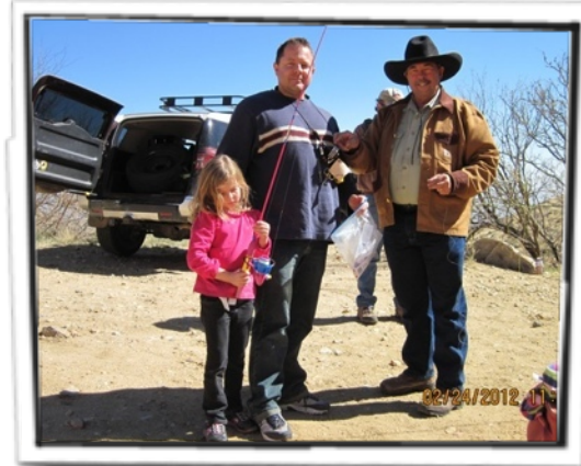
Having fun at the outings