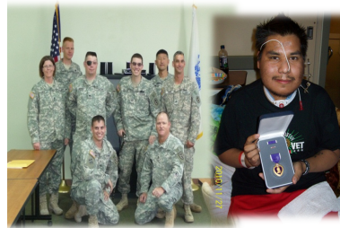
Those who have borne the battle

Help send a Wounded Warrior to the Kobuk River in the North West Arctic of Alaska