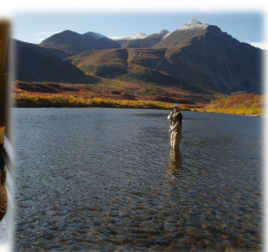
Much needed chance to decompress