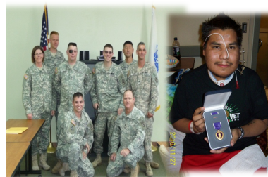
Those who have borne the battle

Help send a Wounded Warrior to the Kobuk River in the North West Arctic of Alaska