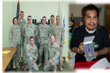
Those who have borne the battle

Help send a Wounded Warrior to the Kobuk River in the North West Arctic of Alaska