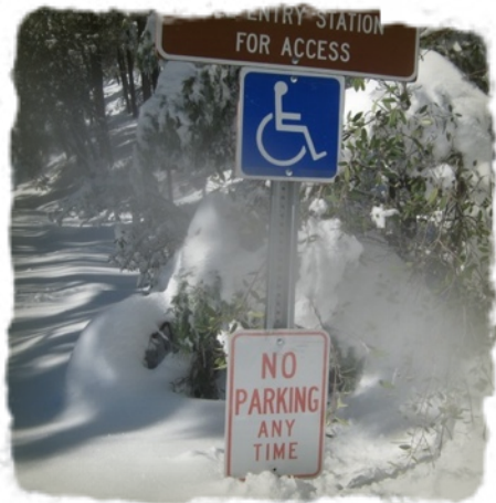
Rose Canyon in Winter