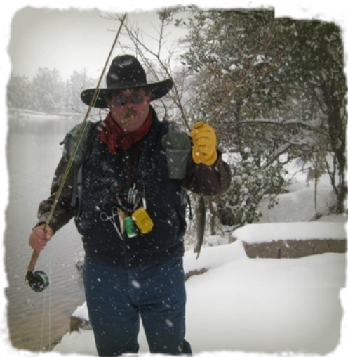
Robin in Winter - At Rose Canyon Lake