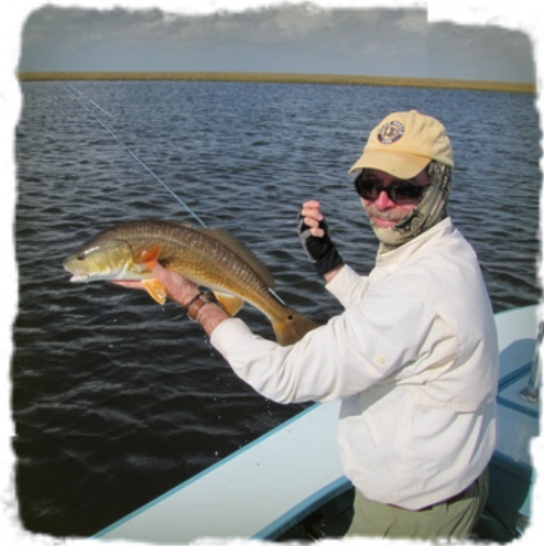
One fish, two fish, redfish, blue fish. Or at least a redfish

to a nice Cajun breakfast at Penny's where we also picked up sandwiches for lunch. The day was quite breezy and overcast - not good conditions for sight fishing redfish, but Capt. Greg managed to find us about 12 to 14 that we caught (we missed at least twice that many due to a variety of reasons - including not paying full attention to the guide instructions, line management challenges, and fish that just decided to be spooked instead of eating the fly). This is exciting fishing watching redfish at close range consider and eat or reject your fly. I can see how it could easily become an addiction. Most of the ones we caught were under six pounds but we saw some bruisers. Fishing is close - perhaps 30 feet at the longest and sometimes 10 feet, so poor casters like me can participate. The big challenge is line management and being prepared - along with the potential for bad weather of course. I would recommend Captain Dini but if you don't book six months in advance it will be a challenge. I think he is fully booked through February right now. He does have some compatriots that he will book for you if he isn't available - so give it a try if you are in the vicinity. Just Google his name for contact. The Editor