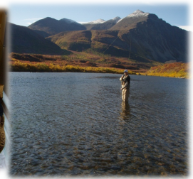
Much needed chance to decompress